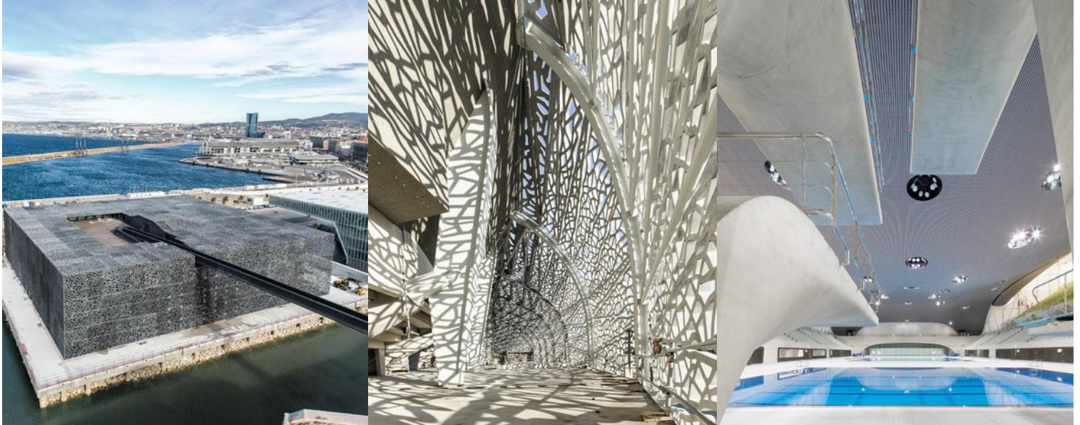
DR Médiathèque Lafarge - Charles Plumey Faye - Rudy Ricciotti (architect)

Contribute to building more beautiful cities means enabling daring architectural designs by providing concretes that give the designers greater freedom. Our concretes combine technical solutions and flexibility in use and offer a variety of textures and options.